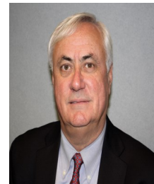
Vacant District 7