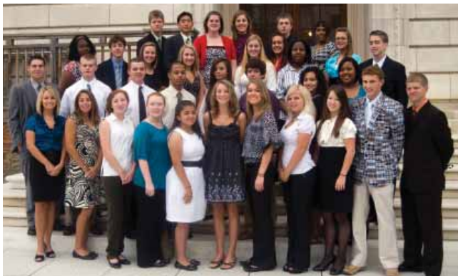
North Carolina students who attended the 2009 Youth Tour in Washington, D.C.