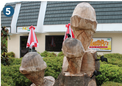
5 You can see Buck Buchanan's wood carving at Lumpy's Ice Cream in downtown Wake Forest.