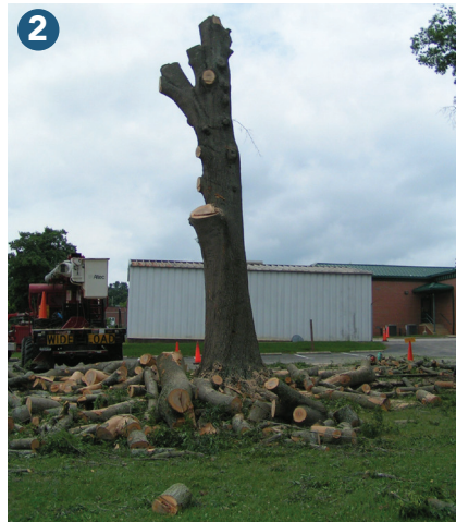
2 During the tree-cutting process.