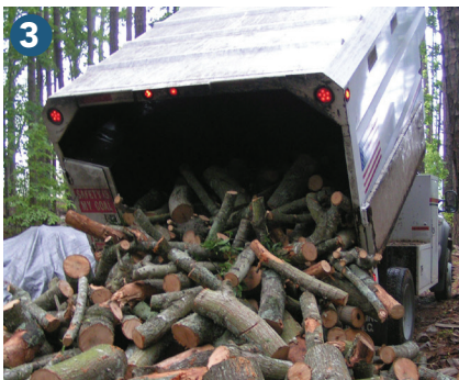
3 Wake Electric was happy to donate these logs to the local Catholic Church's firewood mission program.