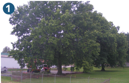
1 The tree before it was cut down.

Lastly, Wake Electric is also planning to use two large logs cut from the trees for lumber for the new building. It's exciting to see the trees from the new construction site go to multiple causes to help others!